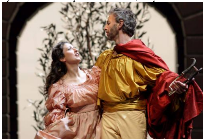
Vocal Music Guide: MONTEVERDI, Tu se morta from Orfeo

- primary location of composition; Venice, Italy